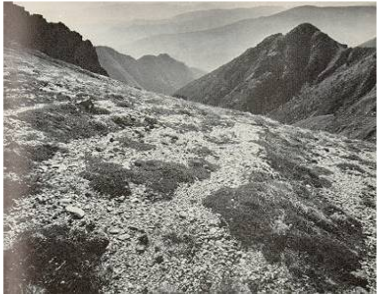
Feldmark community near Carruthers Peak showing the pattern of Epacris microphylla sens. lat. shrubs growing on a stony erosion pavement. The shrubs move slowly across the ridges because of damage to plants from wind on the windward side and layering on the leeward side.

The only confirmed vegetation type containing Feldmark Grass in Australia is feldmark. Feldmark occurs mainly on exposed ridgetops, which have little soil development and abundant fractured rock. There is little snow cover in winter because the prevailing westerly winds blow it off into lee snow patches. The absence of snow cover means that extremely low temperatures and strong winds are experienced for long periods during winter. Surface soil temperatures are high in summer and soil moisture levels are often limiting at that time. Few plant species are able to survive under these conditions. As a result, plant cover is sparse.