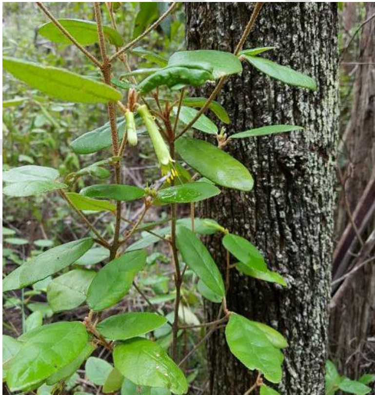
Correa lawrenceana var. genoensis

This document combines the approved conservation advice and listing assessment for the species. It provides a foundation for conservation actions and further planning.