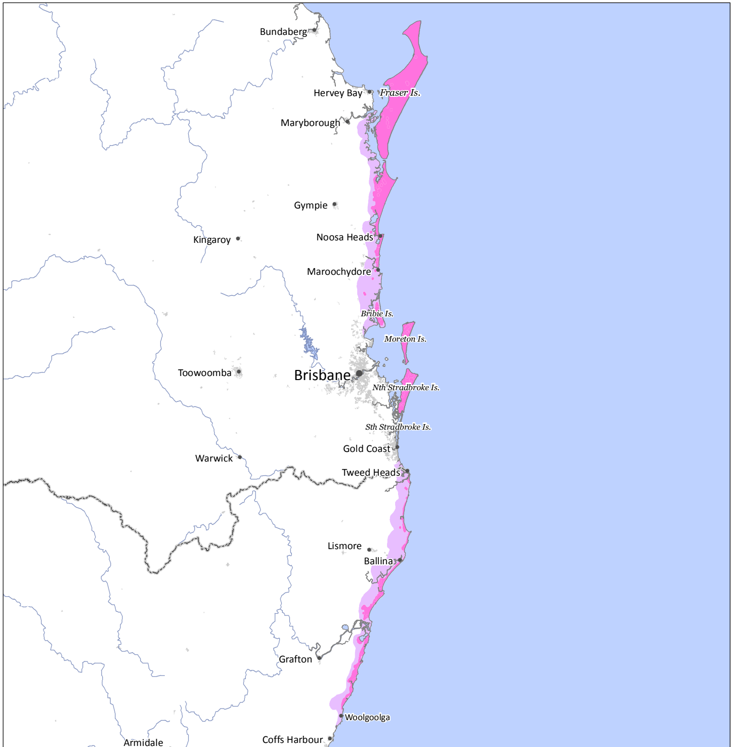
Map 1: The modelled distribution of the wallum sedge frog ( Litoria olongburensis )

INDICATIVE MAP ONLY: For the latest departmental information, please refer to the Protected Matters Search Tool at www.environment.gov.au/epbc/index.html