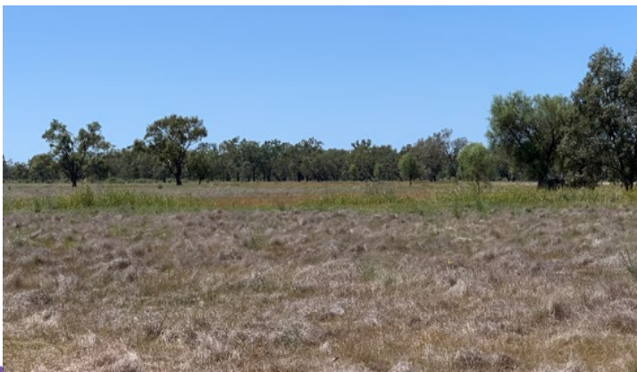
'Valetta' – Mallowa wetlands - 22 February 2021 - CEWO