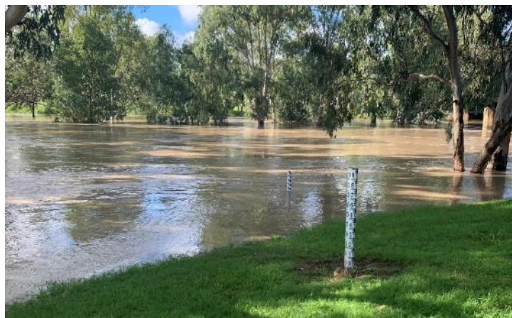
Mehi River at Moree gauge 24 March 2021

Managing water for the environment is a collaborative effort, working in partnership with communities, Traditional Owners, scientists, and government agencies - these contributions are gratefully acknowledged.