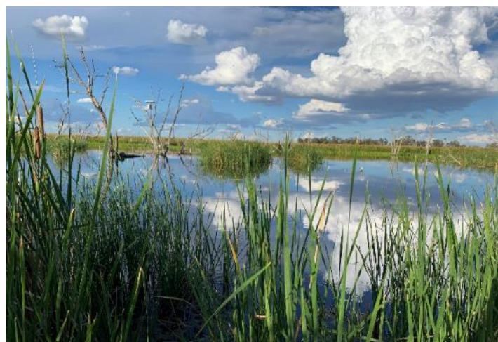
Bunnor Waterbird Lagoon, Gwydir Wetlands State Conservation Area

In combination with natural flows, this water helped improve the condition of the Gwydir Wetlands Ramsar sites located on 'Old Dromana' and 'Goddard's Lease'. Natural flows triggered a small waterbird nesting event. Water for the environment was used to help several colonial nesting species finish their breeding.