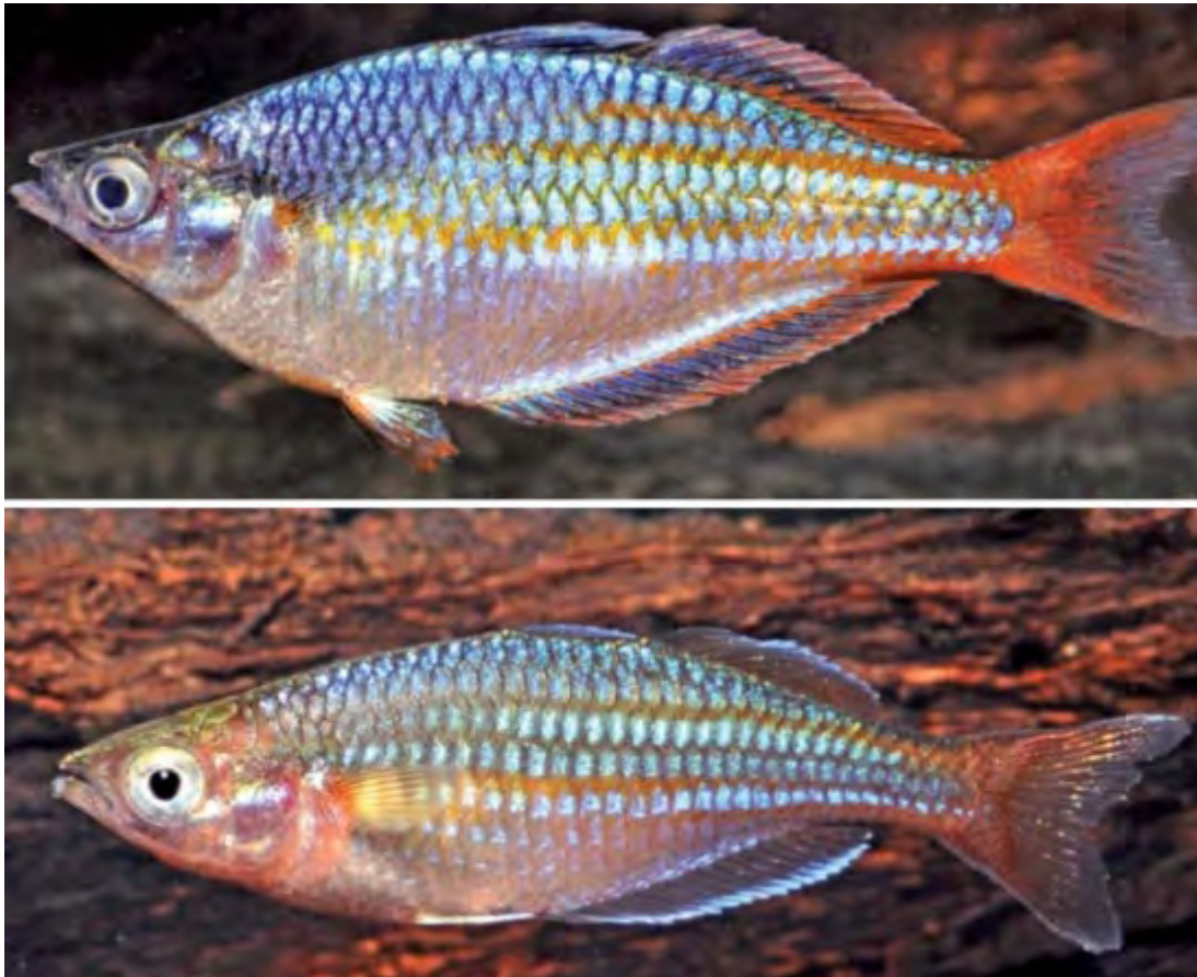
Field aquarium photograph of freshly collected holotype of Melanotaenia rubrivittata , male (upper), 48.7 mm SL and female paratype, 40.8 mm SL (WAM P.31454), Siewa, Papua Province. Photographs © Gerald Allen. (Permission granted)

in Aqua Geographia, "... males have red-edged fins while the fins of females are pure yellow". However, my original females had red fins and succeeding generations produced red-finned females, although at times they can appear faintly orange coloured. There are however, aquarium stocks that have yellow-finned females".