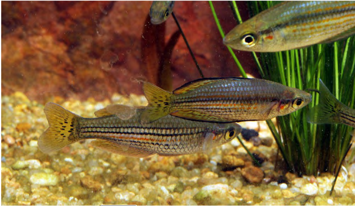
[REDACTED] taken October 2014, permission to publish 25 Feb 2023

The Jardine River in far North Queensland has five species of Rainbowfish recorded with no record of any hybrids.