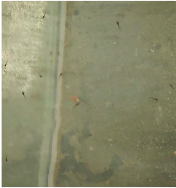
Photo: Johannes Graff – permission to use photo obtained 28/01/2023

The visual identification of the species from eggs or larvae would not be possible. To correctly identify species from such a small sample would require the use of a molecular biologist to identify samples to DNA level..