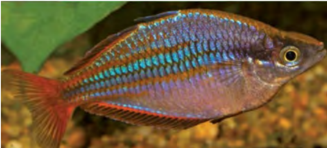
Male specimens of Melanotaenia rubrivittata raised in captivity, approximately 45 mm SL. The nuptial display is shown in the upper photograph. Photos © Gary Lange - (Permission granted)

This small species of Rainbowfish was described by Peter Unmack, Gerald Allen and Renny Hadziaty in 2015. The description was published in "Fishes of Sahul" volume 29, number one, commencing on page 846 of the journal. The authors note it is very similar to Melanotaenia praecox but differs in several areas. "A new species of melanotaeniid rainbowfish, Melanotaenia rubrivittata , is described from the Wapoga River system of northwestern Papua Province, Indonesia. The new taxon is described on the basis of 26 specimens, 18.0–48.7 mm SL, collected from two sites near the Tirawiwa River. It is similar to M. praecox in general appearance and morphology, but differs in possessing red body stripes, a more slender body shape in adult males, a slightly longer snout, and fewer lateral scales. Genetic analysis provides additional evidence for the separation of these taxa" (Allen 2015).