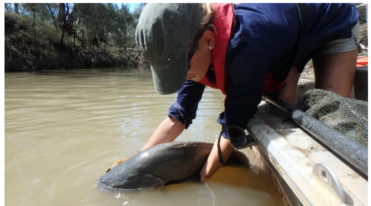
Releasing a Murray cod into the Namoi River.

Delivering water for the environment will keep connection between the lower Namoi River and the Barwon River. This will improve water quality and allow native fish to move between the two river systems.