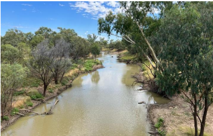
Lower Namoi River at Bugilbone Bridge.

In spring 2023, water for the environment will be used to help build a healthy environment for native fish. This will improve opportunities for them to breed and grow and help native fish populations survive the next drought.