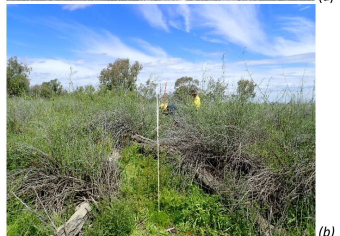
Lignum (a hardy needle-like shrub) responded well to flows at a Back Lake survey site improving from (a) 'Poor-intermediate' in March 2020 to (b) 'Good' in September 2020.