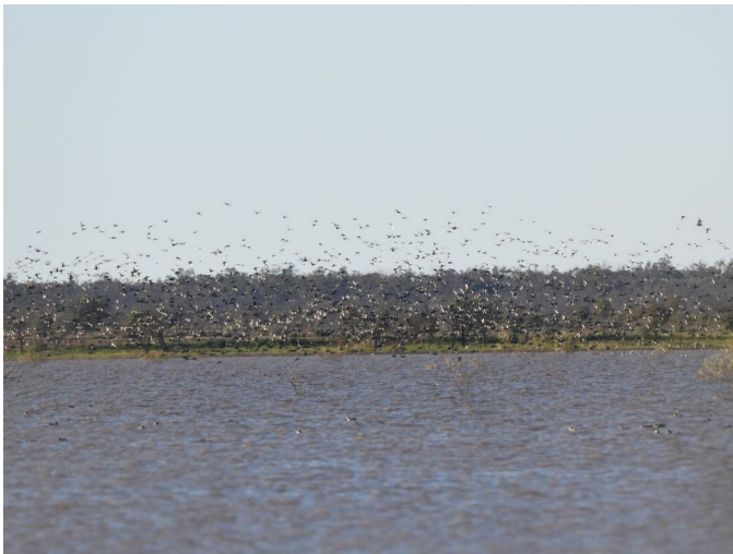
Clear Lake teeming with ducks.

These outcomes are encouraging, however inflows of at least 150 GL would be required during warmer months to trigger a large-scale waterbird breeding event.