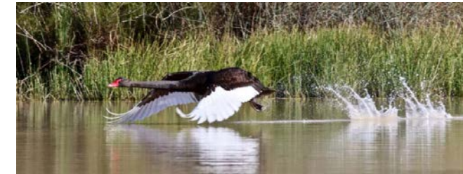
Black swan taking off on the Warrego.

CEW was triggered in the Warrego River in both Queensland and NSW in 2019-20. The CEW in Queensland flowed down the Warrego, and much headed west into the Paroo River and topped up important wetlands there. The 16.2 GL of CEW in the NSW Warrego added important flows to the Darling. CEW in the Moonie River contributed 4.5 GL to the Barwon. There was also 1.9 GL of CEW accounted in Nebine Creek. There was no CEW available for delivery in the Namoi or Peel catchments in 2019-20.