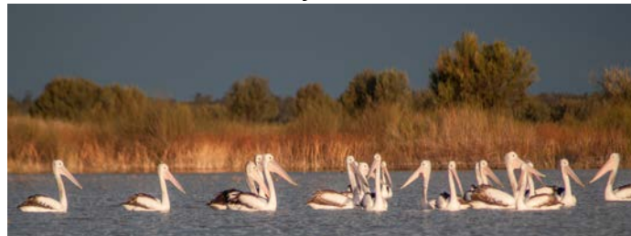
Narran pelicans.