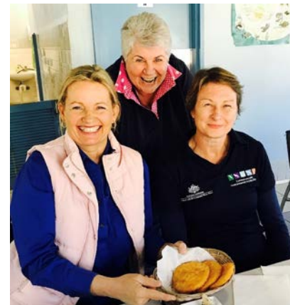
Environment Minister Sussan Ley and the Commonwealth Environmental Water Holder Jody Swirepik with the Mayor of Moree Katrina Humphries at her fish and chip shop in 2019

The CEWO acknowledges the Traditional Owners of the Murray-Darling Basin and their continuing connection to land, sea and community. We pay our respects to them, to their cultures and to their elders both past and present.