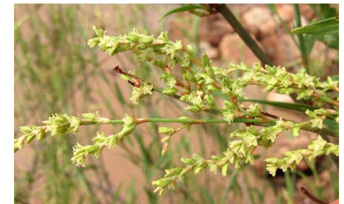
Flowering lignum plant on the Narran River in early 2020.

Further detail on current activities can be found in the Water Management Plan and flow updates (links provided on the back page of this fact sheet).