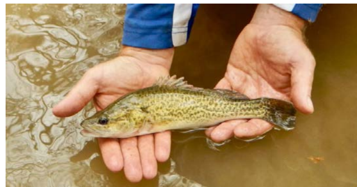
Juvenile Murray cod (an endangered species) in the Gwydir.

In the Summer of 2019-20 the CEWO and NSW each provided 6 GL of replenishment flows to key refuges in the Gwydir system. The Gwydir Recovery Flow also provided 3.1 GL of Commonwealth environmental water to rivers and wetlands across the Lower Gwydir, Gingham and Mallowa systems. Later, unregulated flows helped further in greening up the riverine landscape.