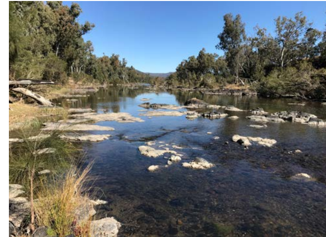
The Dumaresq River.

Unregulated entitlements contributed 3.2 GL of CEW to help replenish permanent waterholes with high value refuge and fish habitat to support local movement and habitat access for native fish.