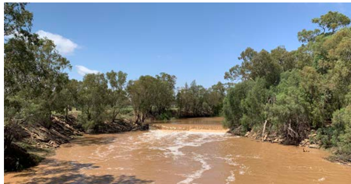
The Macquarie downstream of Warren, February 2020.

Several unregulated flow events below Burrendong Dam helped restore the condition of some wetland areas within the internationally significant Macquarie Marshes. The CEWO worked with NSW delivery partners to deliver 3.9 GL of Commonwealth and 0.7 GL of NSW supplementary water to the Marshes. Flows provided under water sharing plan rules also contributed additional volumes.