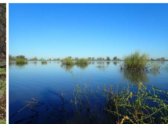
Left: Downstream of Bora Well, Macquarie Marshes in March 2020.