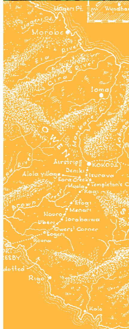
Map illustration by Will Newton