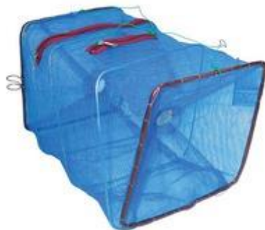
Figure 1. Photo of type of bait trap that will be used to quantitatively sample crustaceans.