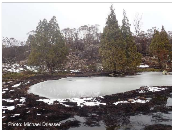
Subalpine vegetation near Lake Mackenzie four months after the January 2016 fires

The Tasmanian Government has undertaken extensive assessment and monitoring in key areas affected by the fires. This includes the alpine area around Lake Mackenzie and the Mersey Forest area. While some areas remain susceptible to ongoing erosion, high altitude grassland, sedgeland and some cushion plant communities are recovering well. The following photos illustrate recovery of subalpine vegetation near Lake Mackenzie.