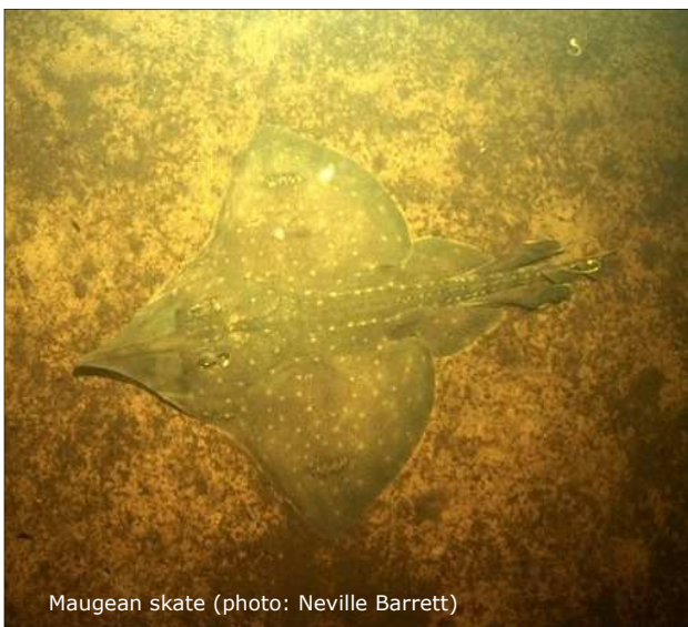
Maugean skate

Increased aquaculture is one of the causes of declining levels of dissolved oxygen in the bottom waters of Macquarie Harbour. Other causes include organic load from freshwater inflows from the Gordon and King rivers.