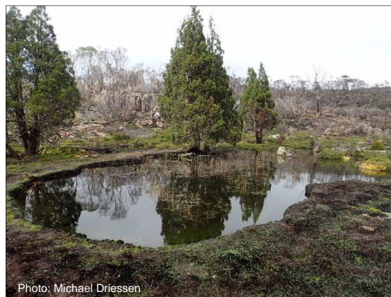
Subalpine vegetation near Lake Mackenzie 13 months after the January 2016 fires