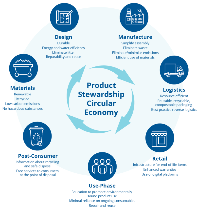
Figure 1 Applying product stewardship measures through a product’s life cycle