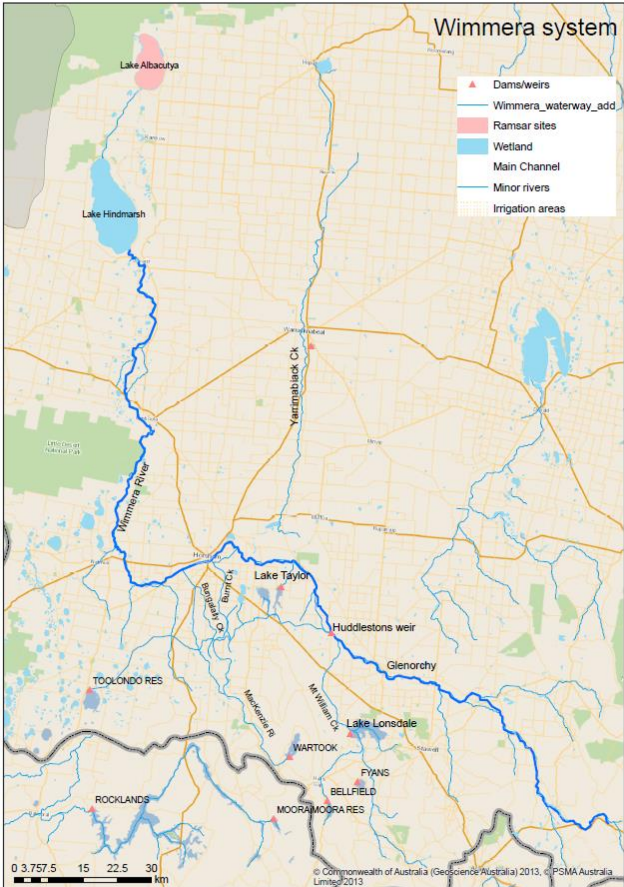
Figure 2: Map of the Victorian Wimmera System