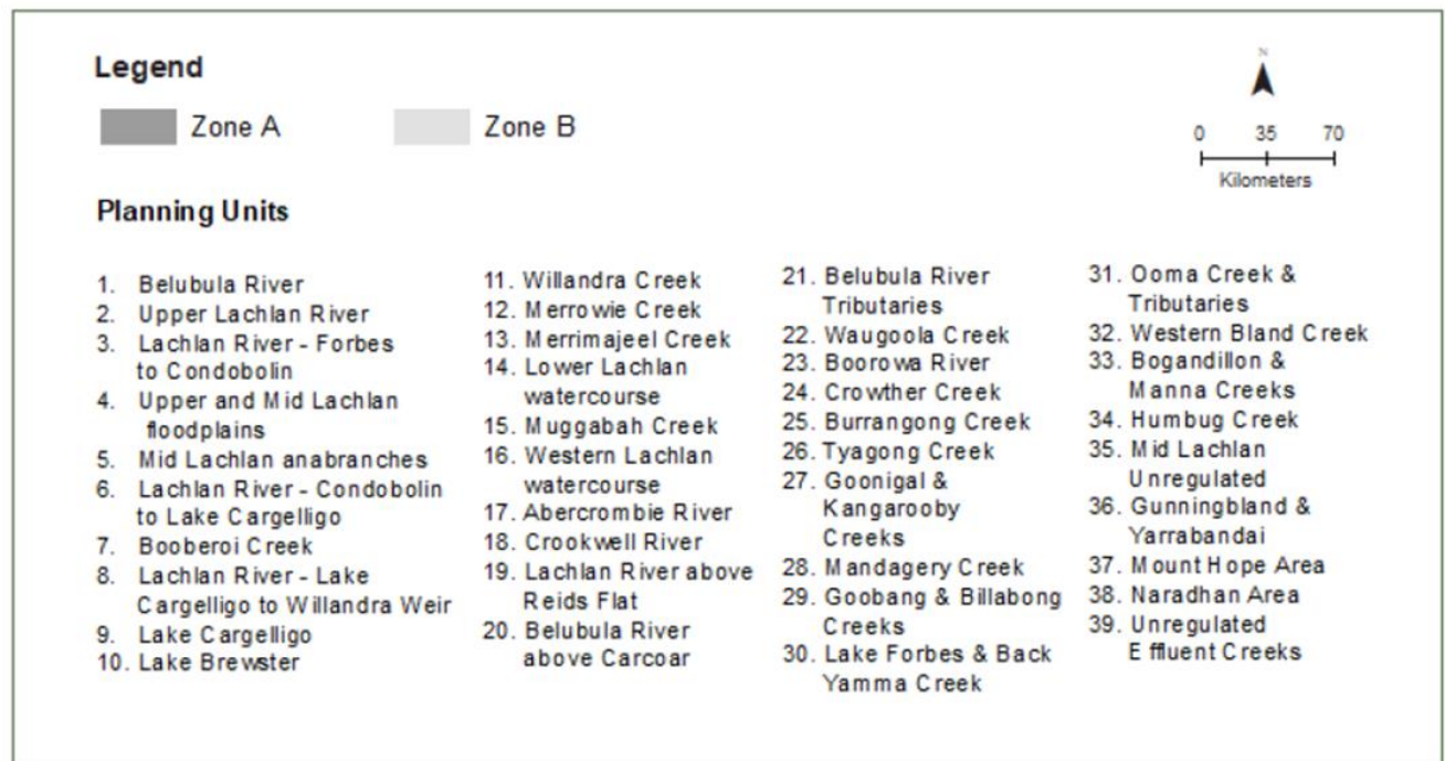
Figure 1: The Lachlan valley showing the division of planning units into Zone A and B as used in the draft Long Term Water Plan for the Lachlan Catchment (NSW OEH 2018a)