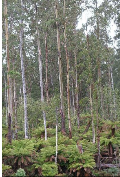
Tall wet eucalypt forest with a dense Dicksonia understorey