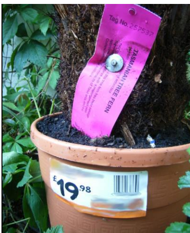
Tasmanian Dicksonia for sale in the United Kingdom