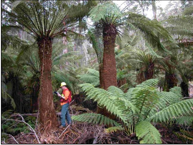
Tall Dicksonia growing in Southern Tasmania