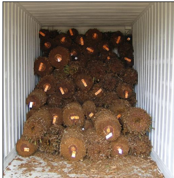
Dicksonia tagged and packed into a refrigerated container ready for export. Note: Some tags are not visible due to stacking.