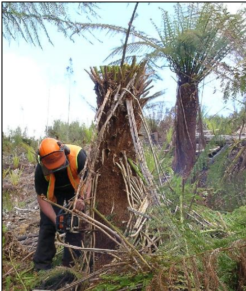
Live Dicksonia being harvested