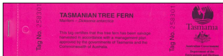
Tasmanian Treefern Tag number 258301