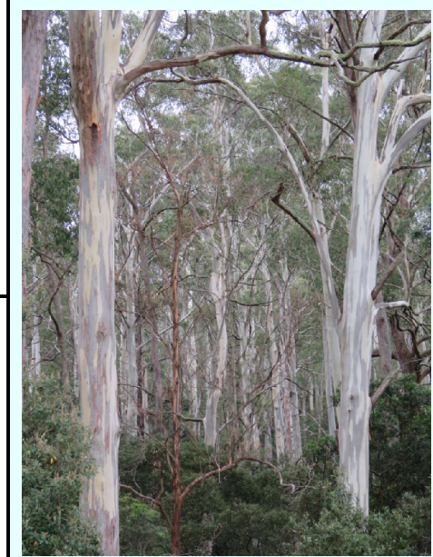
Caveside (Nikki Ward)

This map represents possible occurrences of the ecological community based on comparable vegetation mapping data. Ground truthing is required to verify if a particular site meets the required diagnostic characteristics and minimum condition thresholds to be the described ecological community. At this resolution and scale many data points blend together to give an artificial impression of larger intact areas than actually remain.