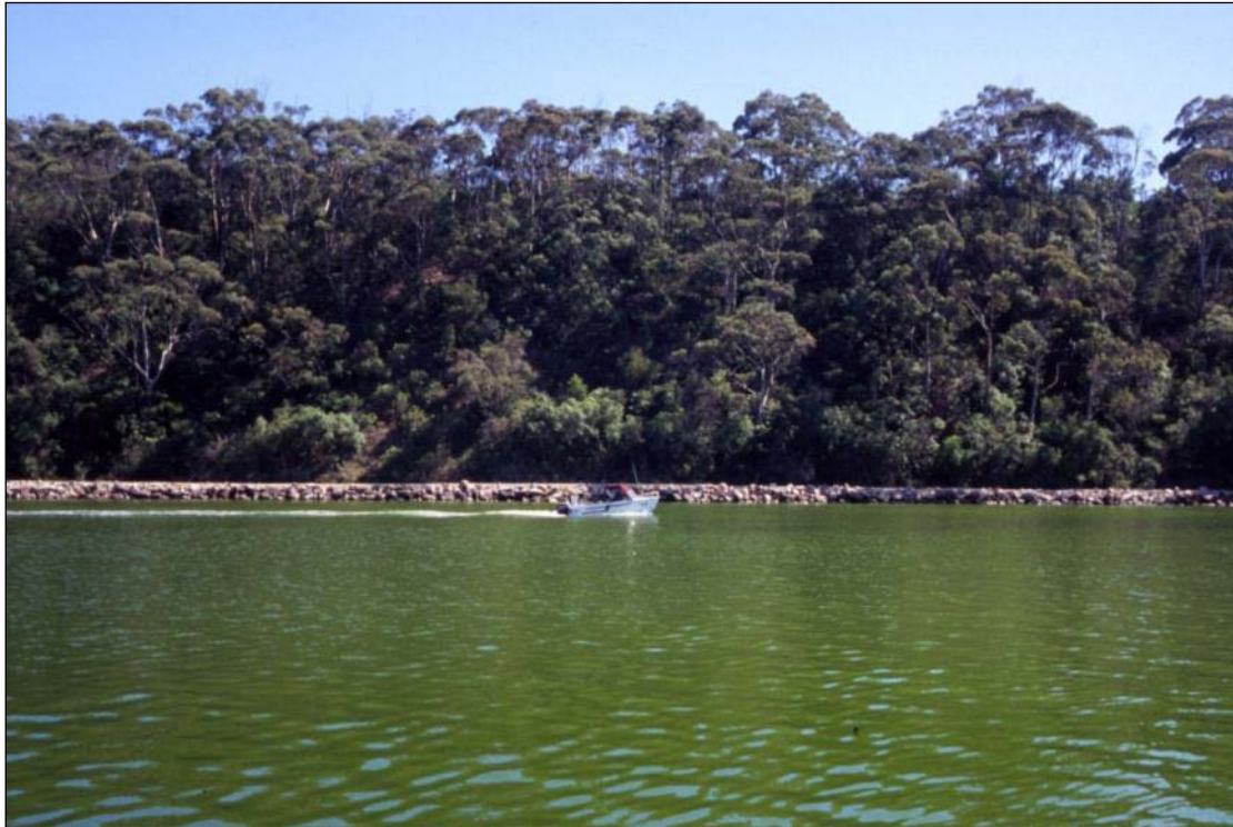
Algal bloom in the Gippsland Lakes in 2008

While these physico-chemical changes to water quantity and quality in the Ramsar site continue to be observed and studied, there is little information available to quantify the associated ecological impact of the changes, particularly in the context of critical components and processes such as waterbird abundance and usage and impacts to key life-cycle functions such as breeding.