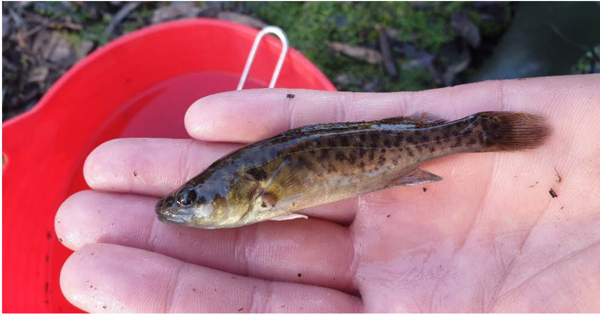
Juvenile Murray cod captured at Mantangery Lagoon, March 2020

No fish were detected at Sunshower Lagoon, however dissolved oxygen levels have improved from <math><1.0\text{mg/L}</math> in January to over