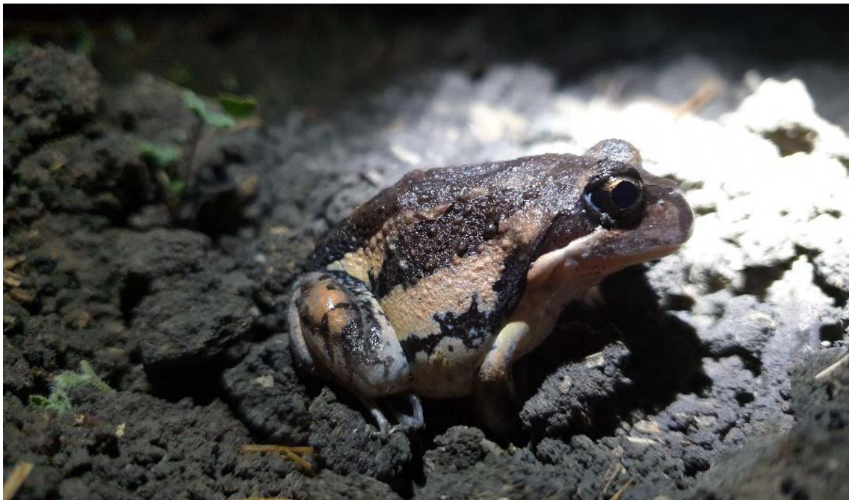
Inland banjo frog observed at Two Bridges Swamp, March 2020

Frogs and tadpoles: As expected, calling activity has now largely ceased for the season, with no calling activity recorded across the Lowbidgee sites. Frogs were continuing to call in small numbers at all wet sites in the mid-Murrumbidgee, with four species heard calling at Sunshower Lagoon (barking and spotted marsh frogs, Peron's tree frog and plains froglet). The absence of southern bell frog records during this monitoring period is most likely related to low numbers and hence low probability of detection. The southern bell frog population at Sunshower is expected to increase with the use of environmental water to maintain more natural flow regimes, restore wetland vegetation and create breeding opportunities.