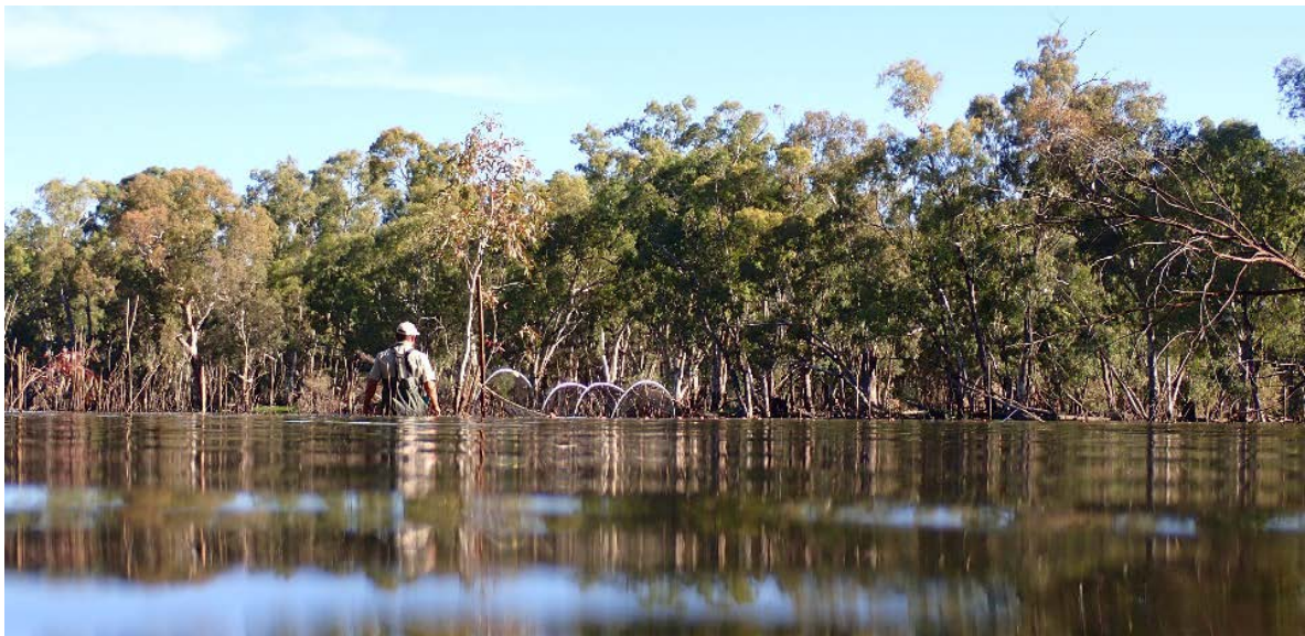
Netting at Mantangery Lagoon, March 2020

Routine wetland monitoring activities targeting vegetation, water quality, fish, frogs and tadpoles were completed at five sites. Three sites (Piggery Lake, Mercedes Swamp and McKenna's Lagoon) were completely dry, and two sites contained insufficient water for netting (Two Bridges, Nap Nap Swamp). Mantangery Lagoon was monitored as an alternative wetland in the mid-Murrumbidgee. Waugorah Lagoon was full, and Avalon Dam, Eulimbah Swamp and Telephone Creek were inaccessible due to the Covid-19 shutdown of the Gayini Nimmie-Caira reserve.