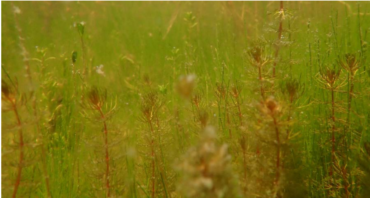
Submerged aquatic vegetation – red watermilfoil and small spike rush at Eulimbah Swamp, March 2020

In Yanga NP, Mercedes Swamp contains residual water in the main body, with several larger carp (deceased) noted at the deepest point. Two Bridges Swamp, Piggery Lake and Waugorah Lagoon are dominated by colonising annuals including common crumbweed, heliotrope and small amounts of common sneezeweed.