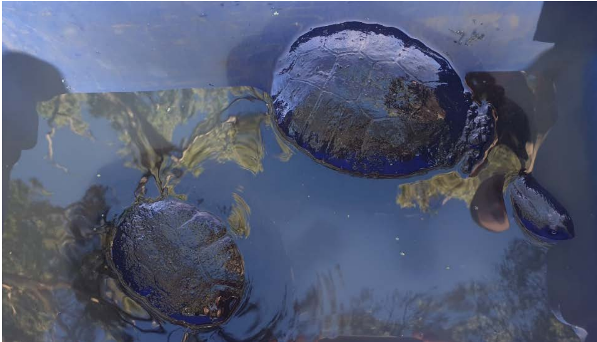
First eastern long-necked turtles recorded at Sunshower Lagoon since watering commenced late last year, March 2020

Turtles : Two turtle species (eastern long-necked and broad-shelled turtles) were captured during March monitoring activities. A juvenile broad-shelled turtle was detected at Waugorah Lagoon, and three eastern long-necked turtles were captured at Sunshower Lagoon. These are the first turtles detected since the wetland was filled in December 2019. A broad-shelled turtle was detected at Yarradda Lagoon for the first time since January 2018.